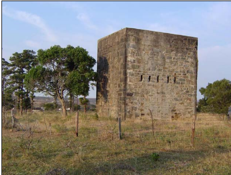
Fort Peddie watchtower

Napier have not borne fruit, but when discussion was opened to the audience, there was a lively response of comments and suggestions. We look forward to hearing the results of possible successful leads and having a site visit too.